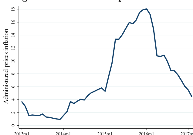
Figure 3: administered prices inflation

Table 2 below presents the results from the same model, but excluding 2015. This was by all means an abnormal year: administered prices inflation went virtually through the roof, possibly swamping the importance of any monetary policy move on inflation expectations 9 . The broad picture is the same, but now the estimations using survey data have much smaller standard-deviations